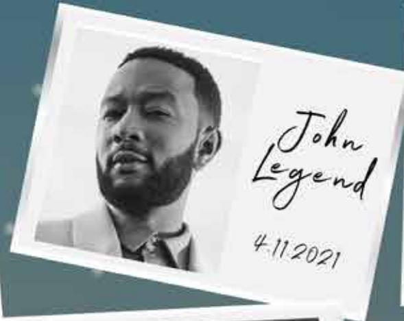
John Legend 4.11.2021