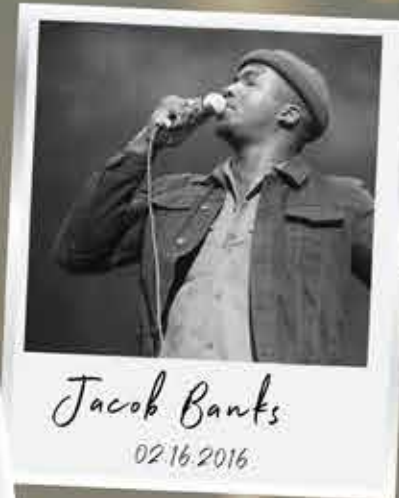
Jacob Banks 02.16.2016