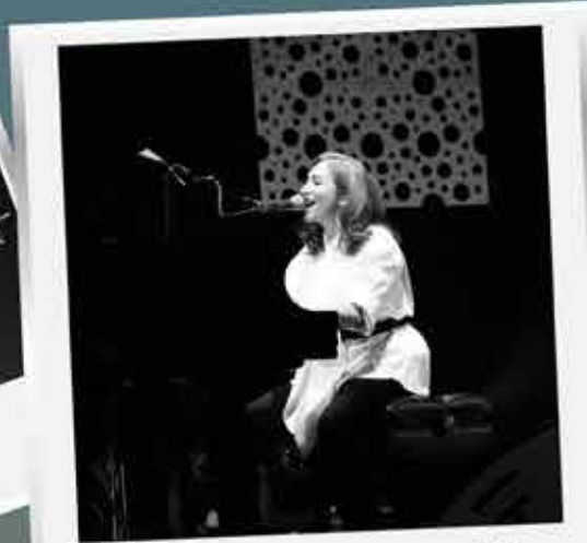
Regina Spektor 02.06.2020