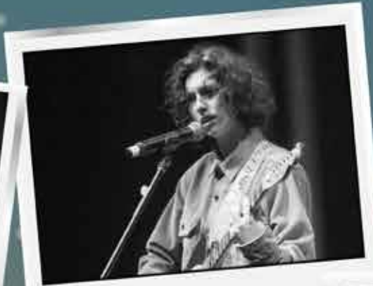
King Princess 2.13.2019