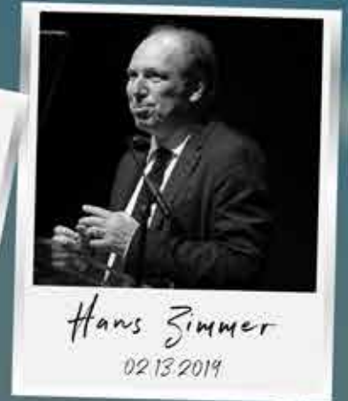
Hans Zimmer 02.13.2019