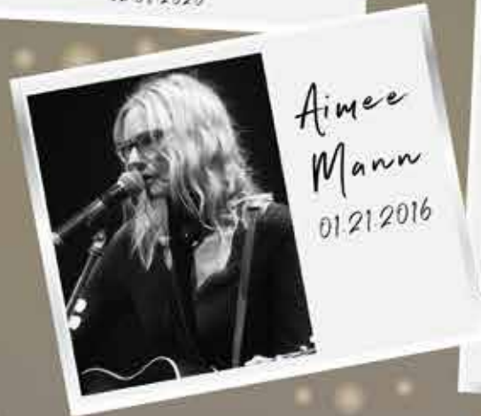
Aimee Mann 01.21.2016