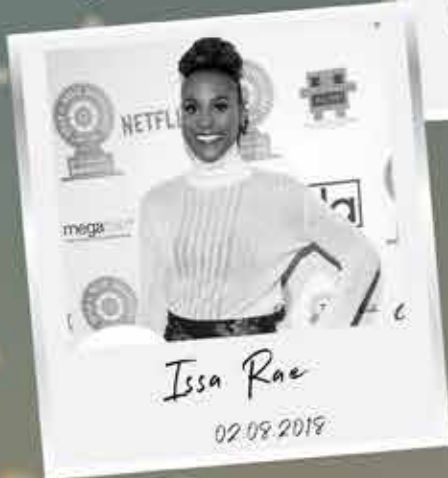
Issa Rae 02.09.2019