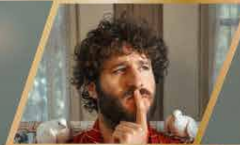
Dave Burd, aka Lil Dicky