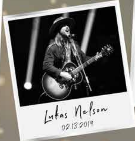
Lukas Nelson 02.13.2019