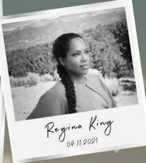
Regina King 04.11.2021