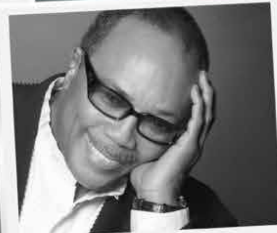
Quincy Jones 4.11.2021