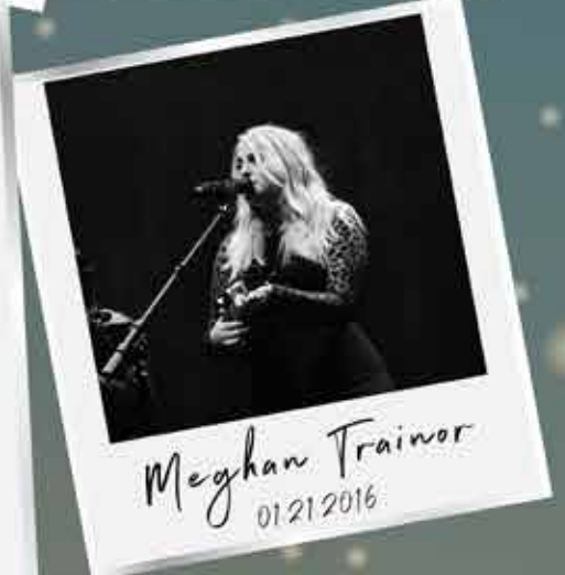
Meghan Trainor 01.21.2016