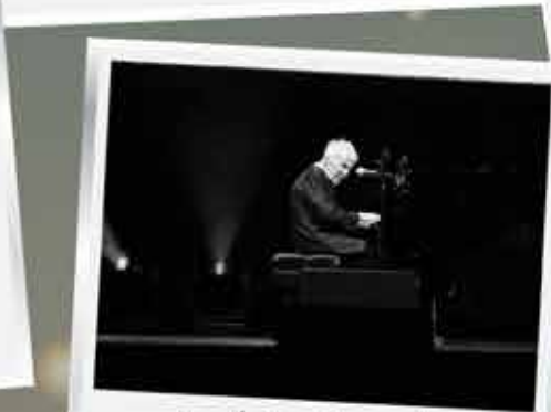
Burt Bacharach 02.09.2020