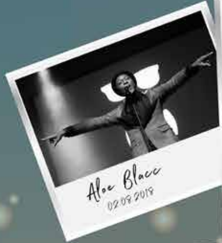
Aloe Blacc 02.09.2019