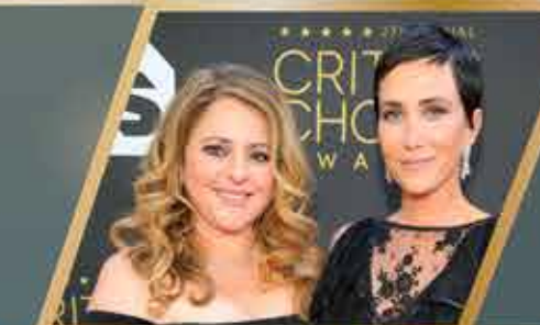
Kristen Wiig & Annie Mumolo