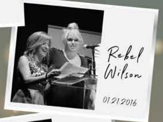
Rebel Wilson 01.21.2016