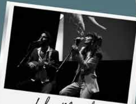
Lola Marsh 02.06.2020