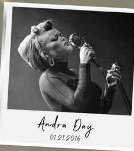
Andra Day 01.21.2016